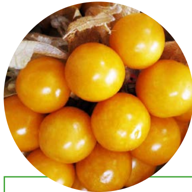
Goldenberries with chocolate