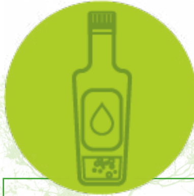
Tropical fruit vinegars