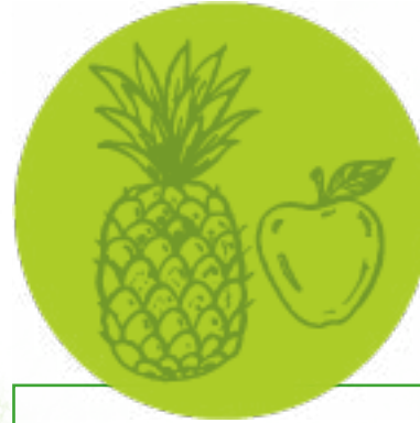
Tropical fruit juices