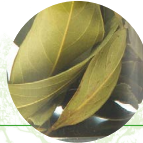
Ishpingo ( Ocotea quixos )