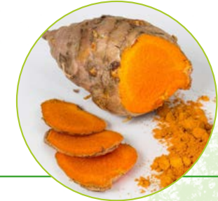
Turmeric ( Curcuma longa )