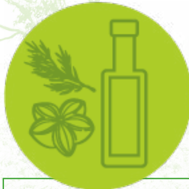
Oil and spices