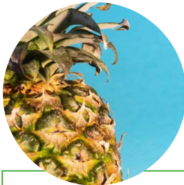
Pineapple with chocolate