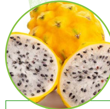
Dragon fruit with chocolate