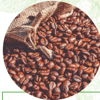
Coffee beans with chocolate