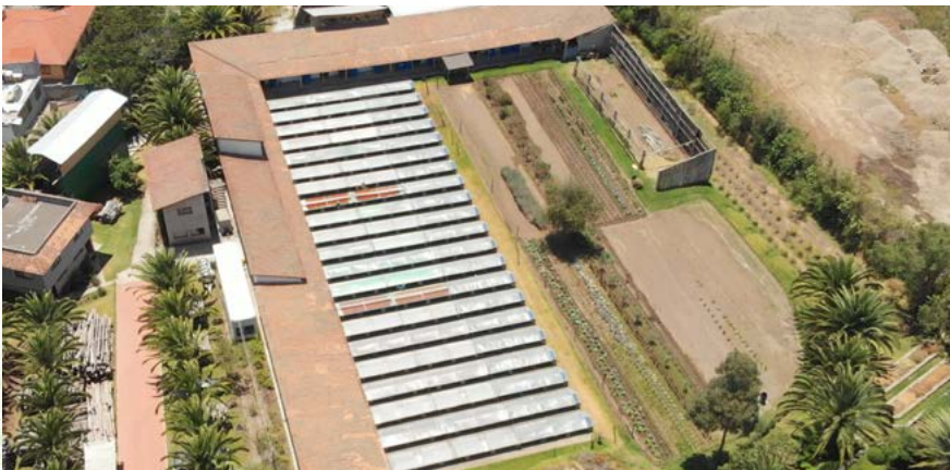
Biolcom facilities solarization panels Pifo - Ecuador