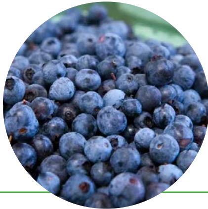
Wild Blueberries with chocolate