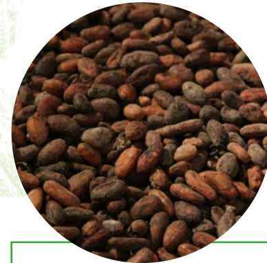
Cocoa beans with chocolate