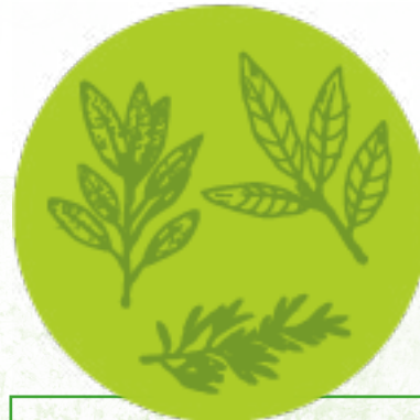
Dried, Extract & Powder