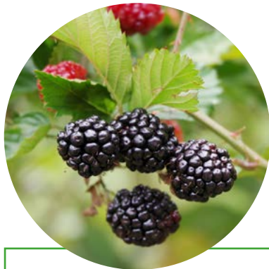
Blackberries with chocolate