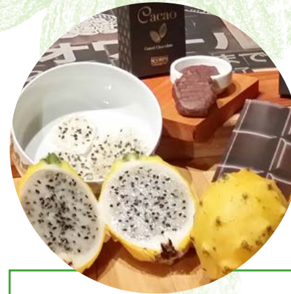
Dragon fruit with chocolate

High in nutrients, antioxidants, lowers blood pressure, prevent heart diseases, improve memory.