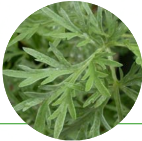
Artemisia Annua ( Artemisia absinthium )

We produce extracts, tinctures, micropulverized, and dried herbs such as Ishpingo, Guayusa, Turmeric and Artemisia Annua.