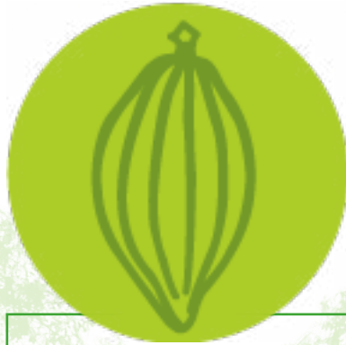
Dried fruits with chocolate