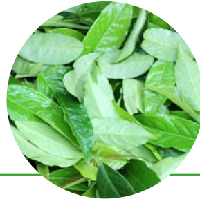
Guayusa ( Ilex guayusa )