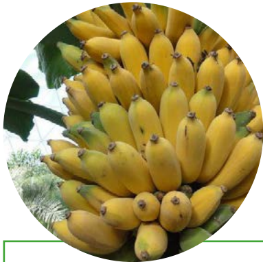
Baby Bananas with chocolate